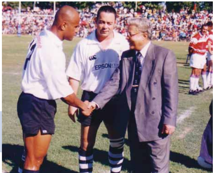
Mahendra Chaudhry, a rugby enthusiast, meets a member of the Fiji team in 2000.

Labour will encourage and assist in the development of sports which not only brings national glory but also provides income earning opportunities on the international circuit.