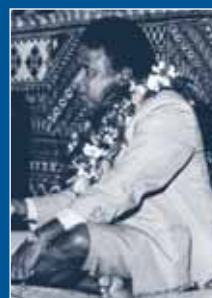
Dr Timoci Bavadra Fiji Labour Party leader, 1986