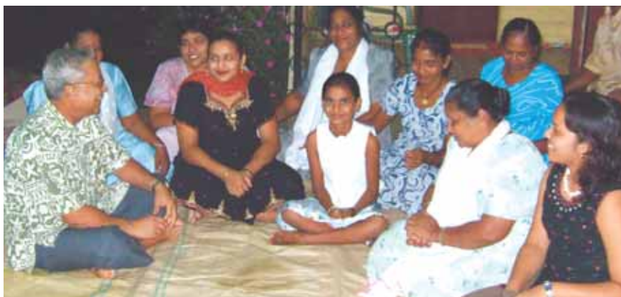
Rural women outline their concerns.

Labour believes that women are equal partners with men, and should play a full and active role in the political, economic, cultural and social life of Fiji.